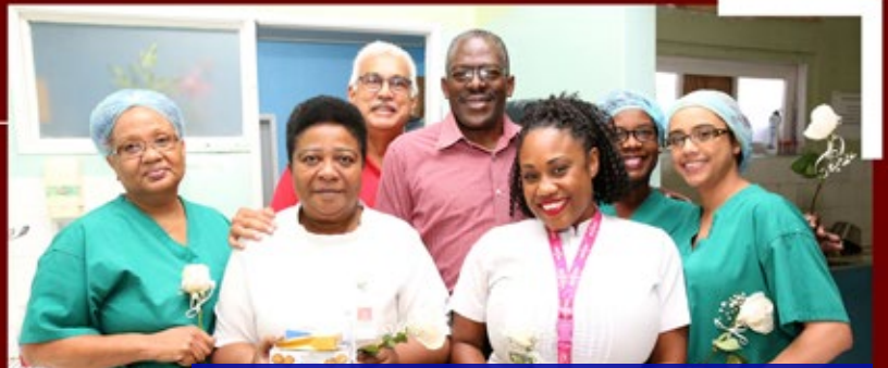
Minister of Health, The Honourable Terrence Deyalsingh and Minister of Housing and Urban Development, Major General Edmund Dillon greets and presents tokens of appreciation to doctors and nurses at the Area Hospital Point Fortin