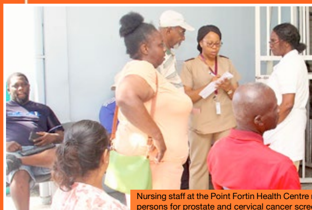
Nursing staff at the Point Fortin Health Centre register persons for prostate and cervical cancer screening